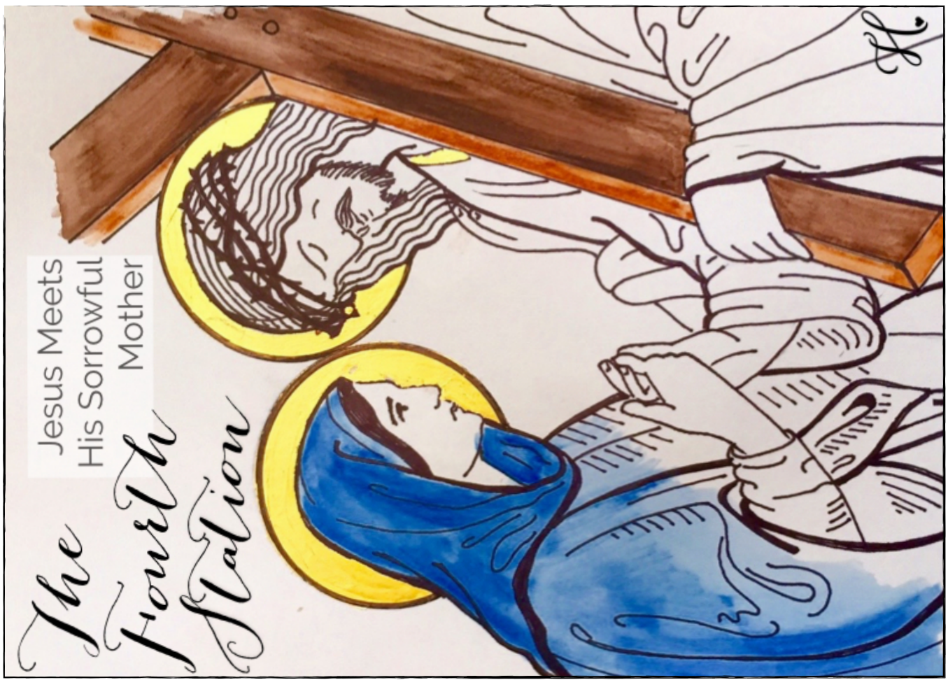
Jesus Meets His Sorrowful Mother